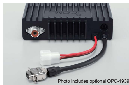
Photo includes optional OPC-1939

With the optional OPC-1939 D-SUB 15-pin ACC cable, the IC-F5022 series can be programmed to control an operating channel from an external device (up to 16 preprogrammed channels). The ACC connector also provides an ignition sensing function, external PTT, PC command, horn honk, audio output and modulated signal input depending on programming.